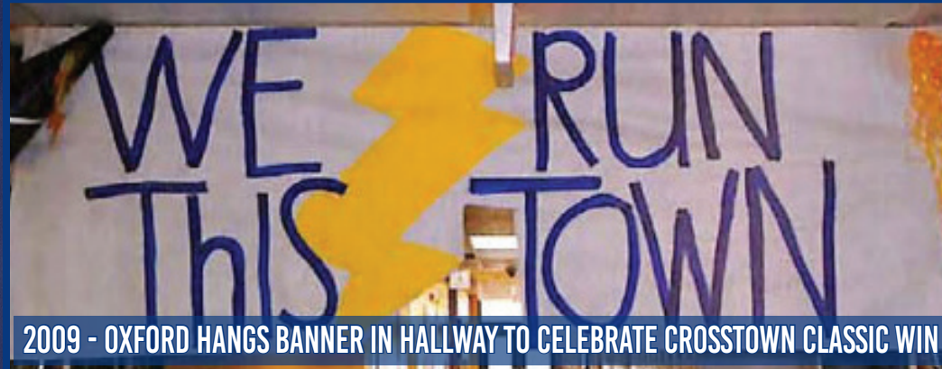
2009 - OXFORD HANGS BANNER IN HALLWAY TO CELEBRATE CROSSTOWN CLASSIC WIN