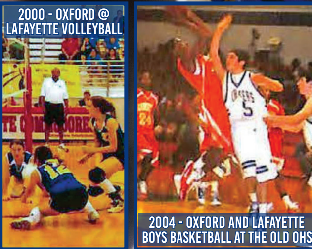
2000 - OXFORD @ LAFAYETTE VOLLEYBALL