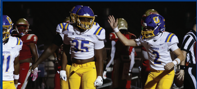
2025 - LAST EVER MATCHUP