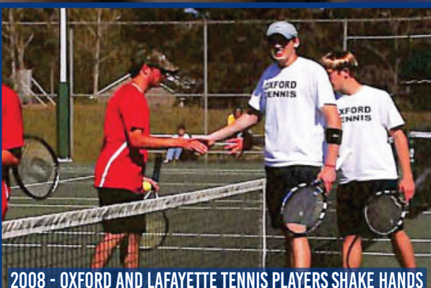
2008 - OXFORD AND LAFAYETTE TENNIS PLAYERS SHAKE HANDS