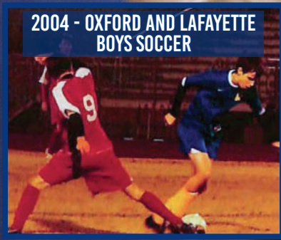
2004 - OXFORD AND LAFAYETTE BOYS SOCCER