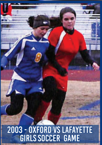
2003 - OXFORD VS LAFAYETTE GIRLS SOCCER GAME