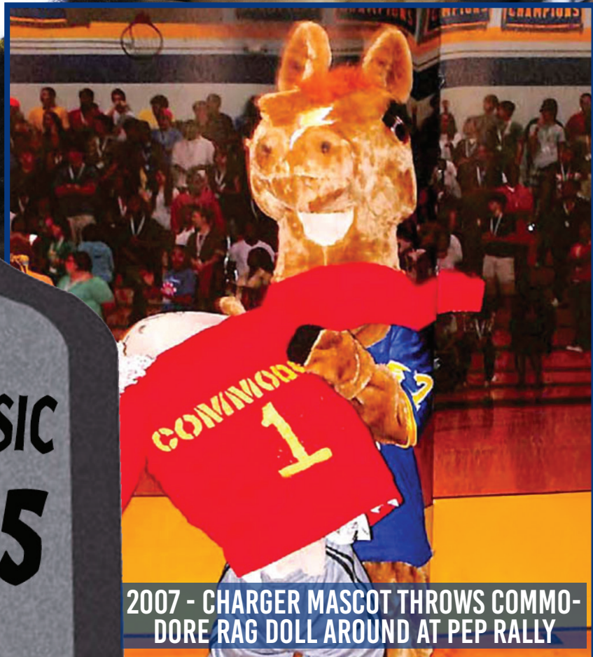
2007 - CHARGER MASCOT THROWS COMMODORE RAG DOLL AROUND AT PEP RALLY