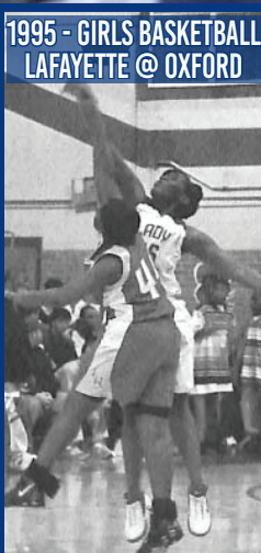
1995 - GIRLS BASKETBALL LAFAYETTE @ OXFORD