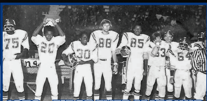
1972 - FIRST EVER MATCHUP