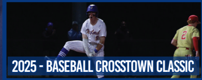
2025 - BASEBALL CROSSTOWN CLASSIC