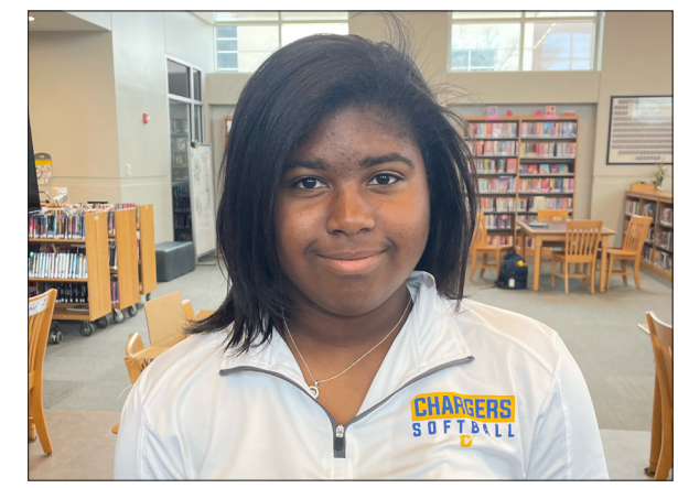
"Yes, I believe because it's allways been a tradition of mine."