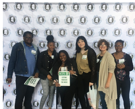
The Multi-Media Reporting and Album Staffs take a picture together to celebrate their achievements at MSPA.