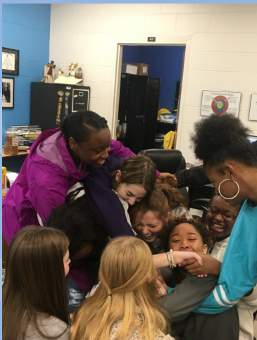
The Album staff works together in an exercise to bring them closer. Here the staff races the other half of the staff to untangle themselves.