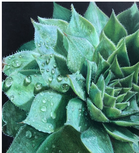
Summer Kirksey (11), Gold Key, Colored Pencil Drawing