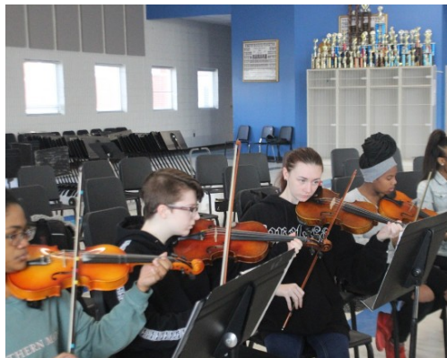
Orchestra's 1st violins rehearse after school.