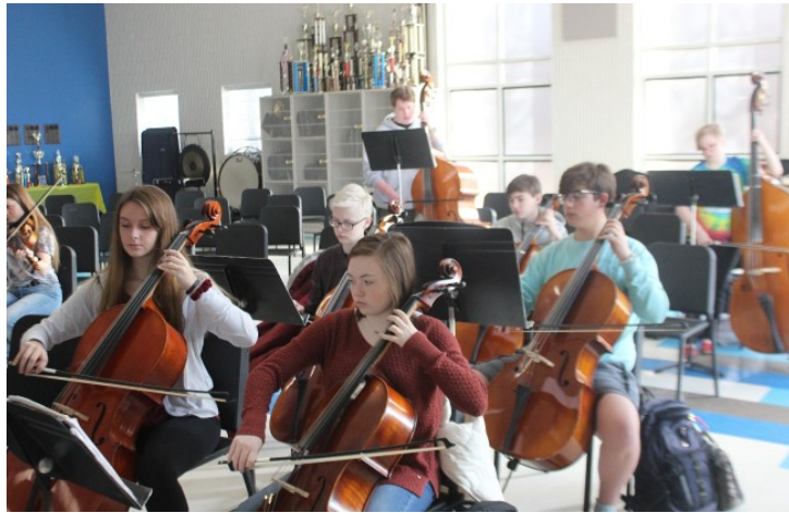
Cellos and Bases are gathered together for rehearsal.