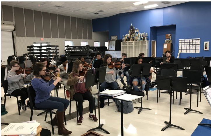
Both violin sections come together for a rehearsal.