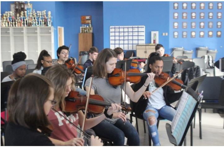
Orchestra's 2nd violins rehearse for perfection.