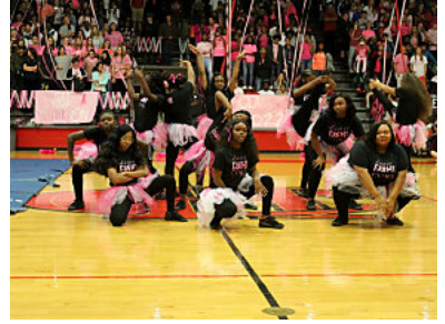
Droppin' Low. The Harrison Central Dance team shows off their moves in front of the whole student body. Think Pink Week is one of the most important events of the year. It is a week full of excitement, tons of pink, and unforgettable memories.