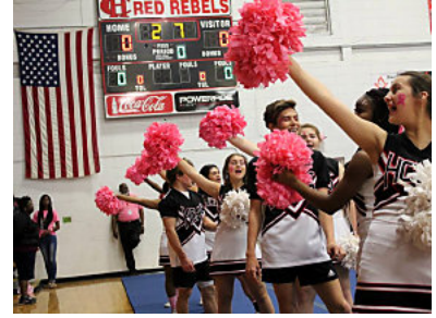
Pink Pride. All of the Junior cheerleaders line up and encourage the Junior class to cheer. All of the students represent their Pink Pride to support breast cancer awareness.