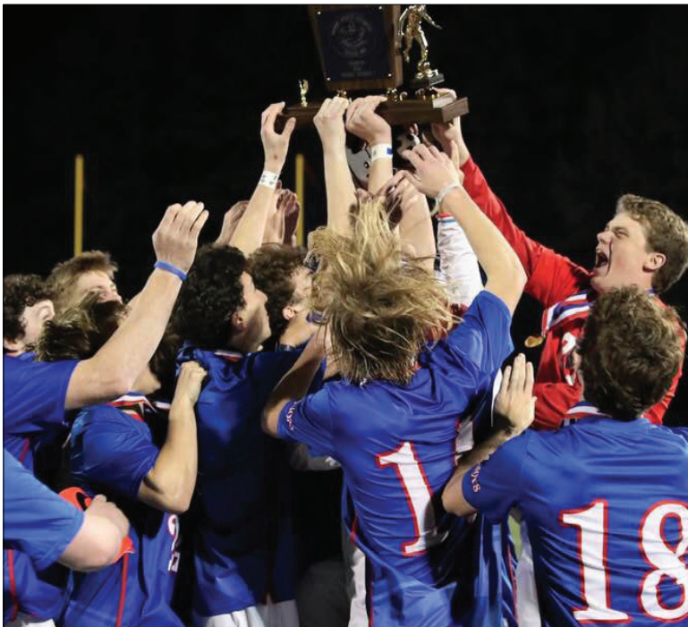
Players and coaches hoist the trophy high after knocking off Jackson Academy 3-0 in the State title game.